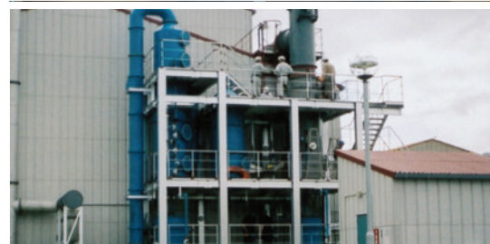
Flue gas treatment