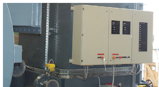
Concentrator chamber and control system