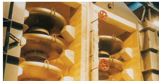
Concentrator trays in brick lined chamber