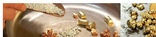
Precious metals recovered